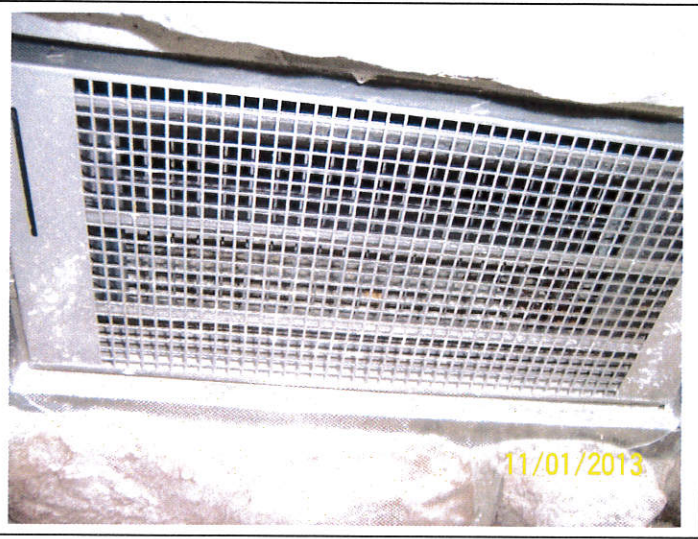
Vent View – Date of Photograph: (See Photo Stamp)