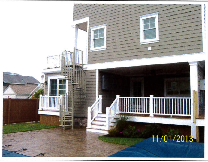
Rear View – Date of Photograph: (See Photo Stamp)