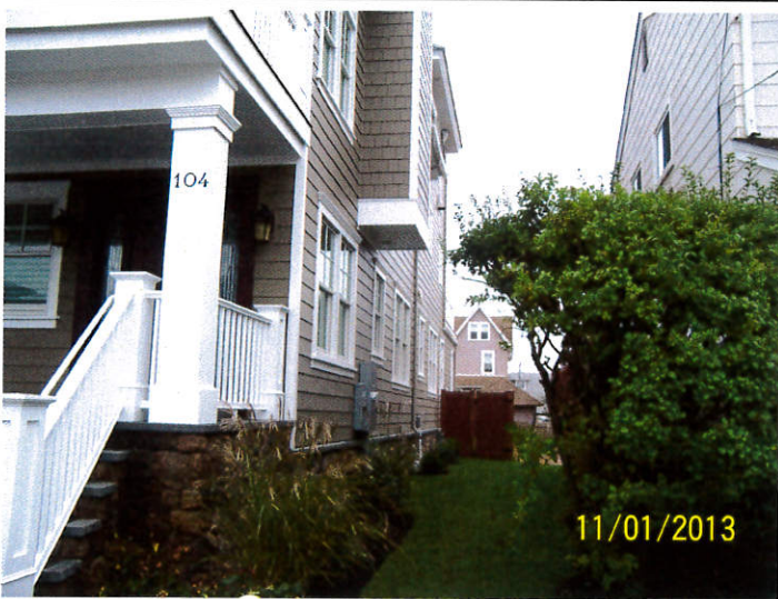
Right Side View – Date of Photograph: (See Photo Stamp)