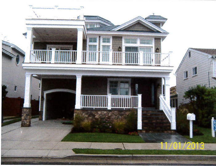
Front View – Date of Photograph: (See Photo Stamp)

If using the Elevation Certificate to obtain NFIP flood insurance, affix at least two building photographs below according to the instructions for Item A6. Identify all photographs with: date taken; "Front View" and "Rear View"; and, if required, "Right Side View" and "Left Side View." If submitting more photographs than will fit on this page, use the Continuation Page on the reverse.